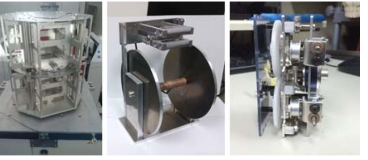
Fig. 9: STARS-E Breadboard model

employed for tether, and its radius is less than 1mm in order to stow 2km long tether. Wheel mechanism has been employed for a climber based on the technologies accumulated in the space elevator challenges in Japan. Separation test for the mother and the daughter, and also vibration test is being experimented.