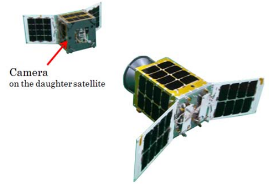
Fig. 1: STARS flight model

Fig. 1 shows the flight model of STARS, which was the first satellite in the STARS project, and whose nickname is "KUKAI." The left and the right figures show the daughter satellite which is a tethered space robot and the mother satellite which has a tether deployment mechanism, respectively, and they are connected by 5m Kevlar tether. Each satellite has two paddles for mounting solar cells, and also antennas named "Solar Paddle Antenna (SPA)," which is attached on the paddle edge. The scale and the mass, without deployable parts, are: