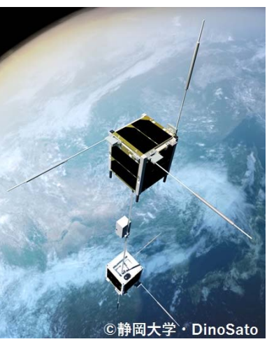
Fig. 7: STARS-Me image

STARS-Me is an extremely small space elevator. It consists of two CubeSats having basic functions independently, and each satellite communicates with the ground station independently. The two CubeSats are connected by a rigid tape tether. One has a climber and approximately 3m tether, and the other has the tether deployment mechanism consisting of approximately 11m tether. The mission sequences are divided into three. (i) Two satellites are first secured together and put into orbit. Thereafter, they will be unlocked. Each satellite will simultaneously deploy their antenna. (ii) By the command from the ground station, two satellites will deploy the tether using motors. After acquiring each detailed data, the separation distance and the stability are analysed. (iii) The climber will traverse on the tether after being unlocked. The climber has a Bluetooth and communicates with the main satellite. From the data of the climber and each satellite, we analyse the behaviour of the mini elevator.