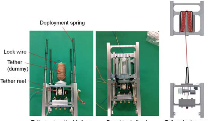
Tether set on the Mother Daughter is fixed Tether deployment Fig. 6: Engineering model of STARS-C

extended as if a wool ball comes loose. Finally, tether extension is terminated by breaking force of the tether reel. Unfortunately, the communication system did not work well, and then telemetry data could not be received well. However, tether deployment was evaluated by the same method of STARS-II, though tether seemed to be extended shorter than expected.